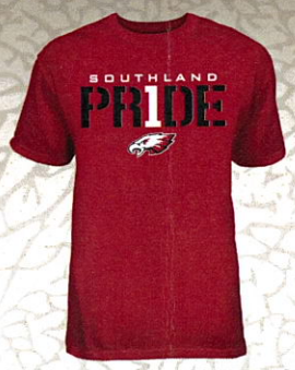
#8 SHORT SLEEVE SHIRT $15 CARDINAL • SIZES: S-3XL