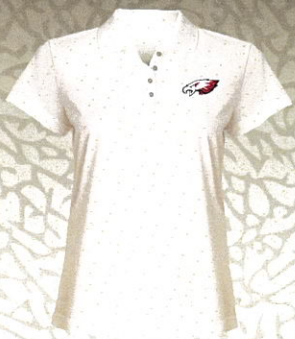
#5 LADIES' PERF POLO $31 WHITE • SIZES: S-3XL