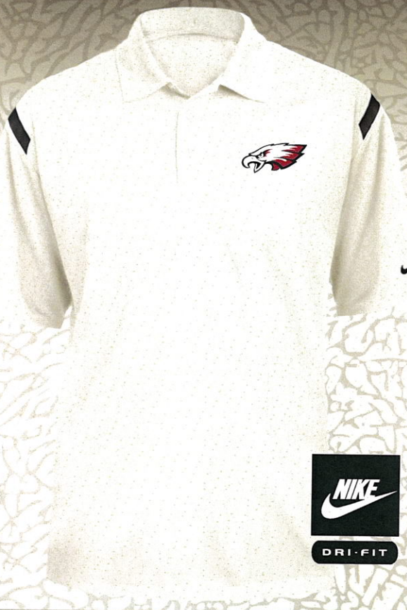
#4 WHITE NIKE POLO $45 SIZES: S-3XL