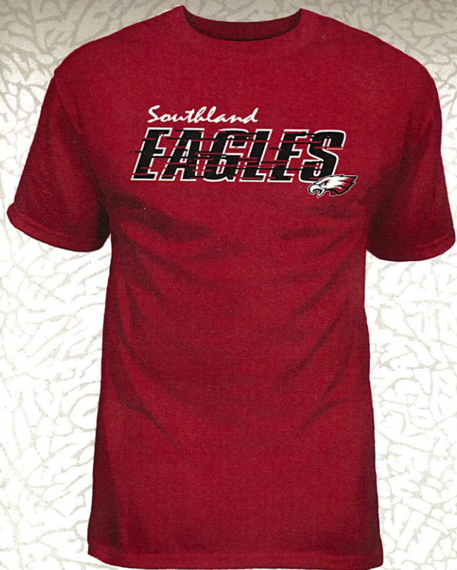
#1 BAROMPHLOPOLS SVEESHIRT $15 SIZES: S-3XL