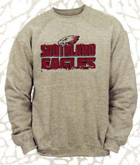
#12 CREWNECK SWEATSHIRT $24 SPORTS GREY • SIZES: S-3XL