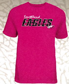
#2 SHORT SLEEVE SHIRT $15 HELICONIA • SIZES: S-3XL