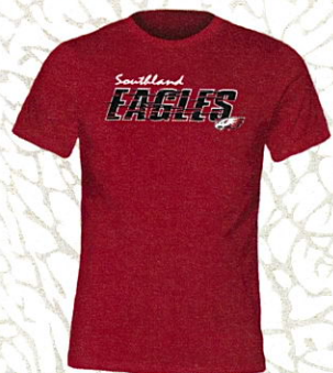
#3 PREMIUM SOFT TEE $18 CARDINAL • SIZES: S-2XL