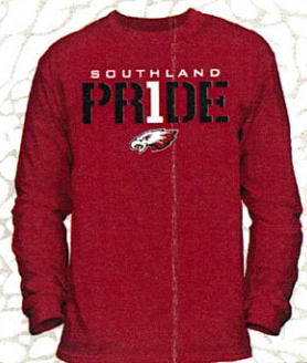
#9 LONG SLEEVE SHIRT $18 CARDINAL • SIZES: S-3XL