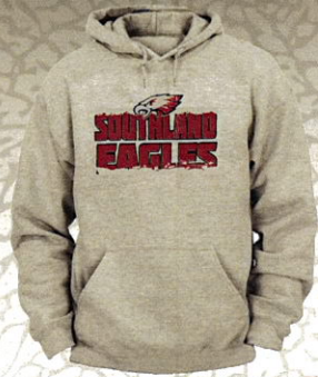
#11 HOODIE $27 SPORTS GREY • SIZES: S-3XL