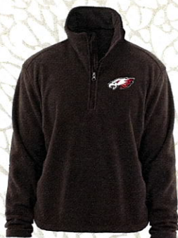
#6 QUARTER-ZIP FLEECE JACKET $37 BLACK • SIZES: S-3XL • NO POCKETS